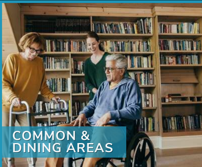
COMMON & DINING AREAS