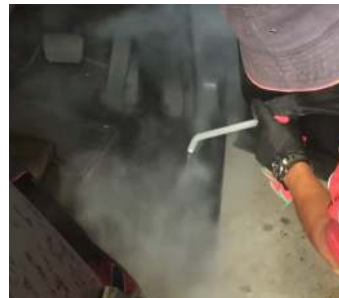
Rubber Door Seals