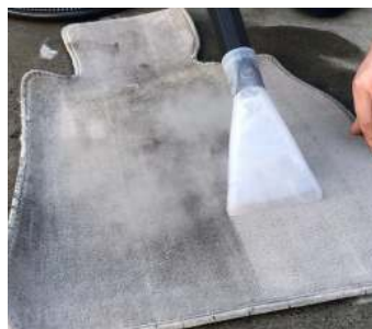
Carpet & Car Mats