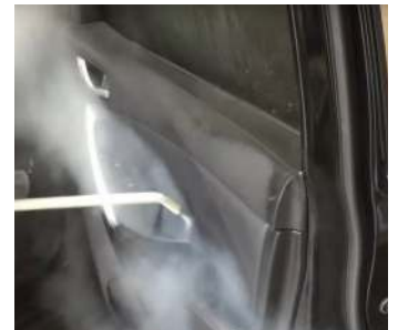
Door Lining & Window Sills