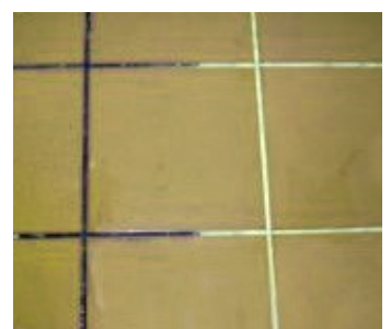
Tiles and Grout