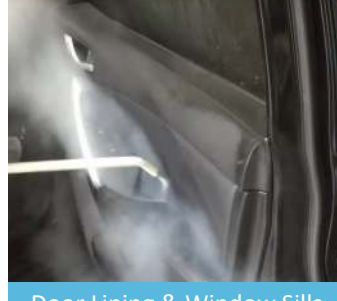
Door Lining & Window Sills