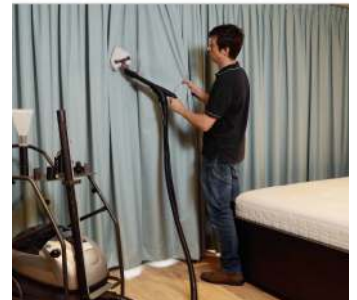
Curtains In Situ