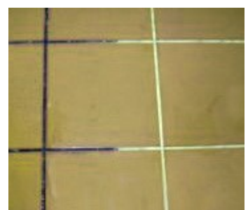
Tiles and Grout